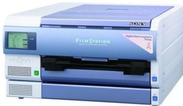
Sony UPD-F750 Mammography