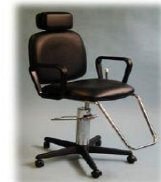
Model 23110 Shown