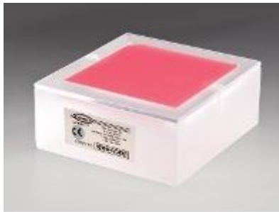
Mammographic Accreditation Phantom